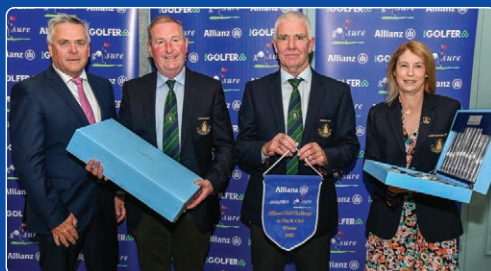
County Cavan Golf excelled once again when our club officers won the Allianz, GOLFERS / Irish Golfer Officer's Challenge 2022 in the K Club last week.